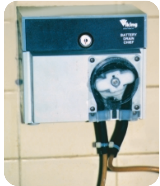
Pro Battery Drain Chief at work in a school kitchen

Digital Timer Provides Easy Programming and Battery Back-Up Maintains Program During Battery Change